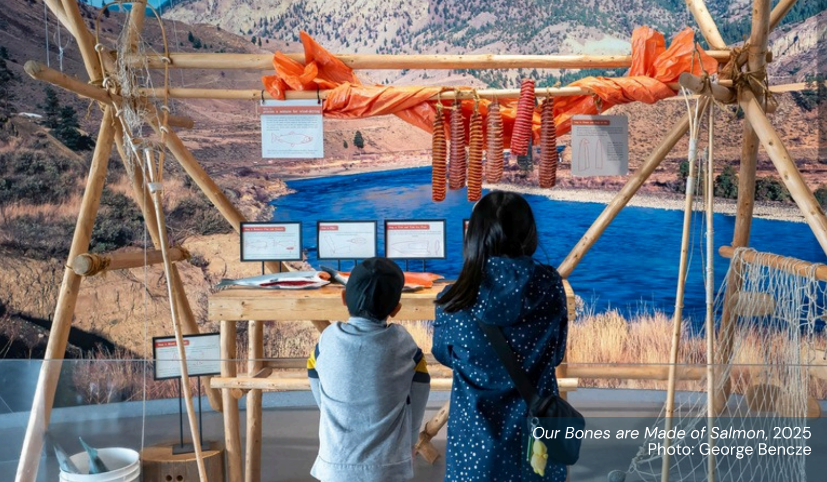
Our Bones are Made of Salmon, 2025