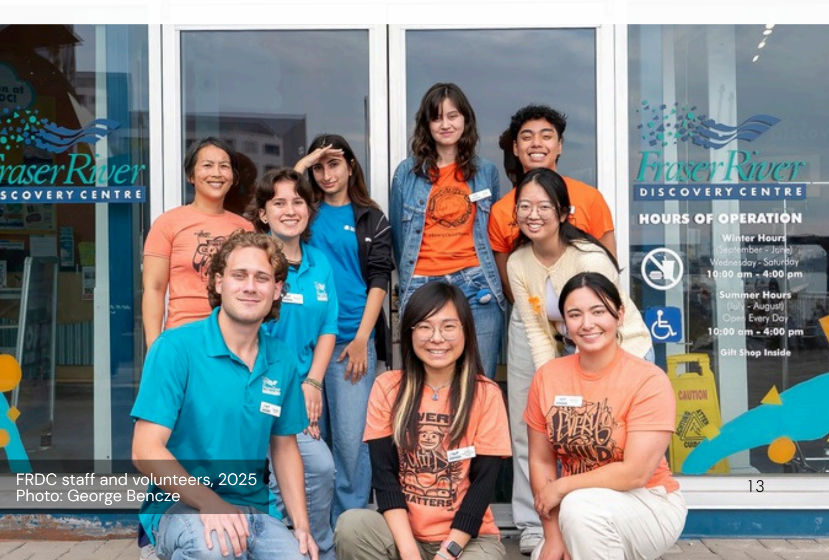
FRDC staff and volunteers, 2025