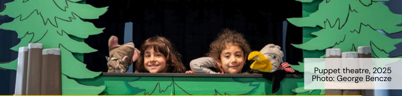
Puppet theatre, 2025