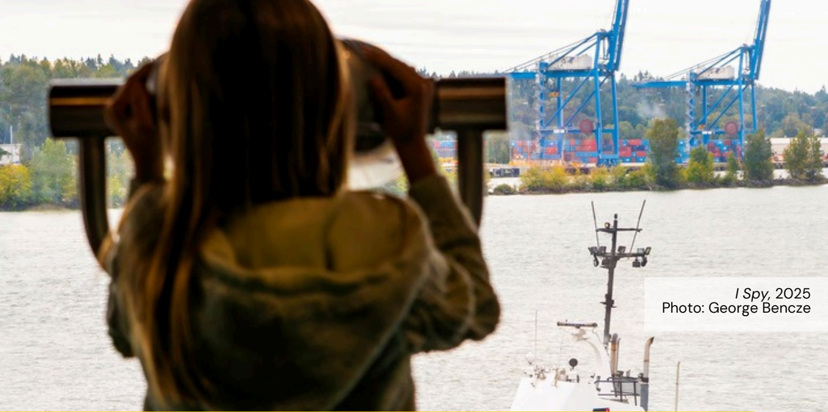
I Spy, 2025