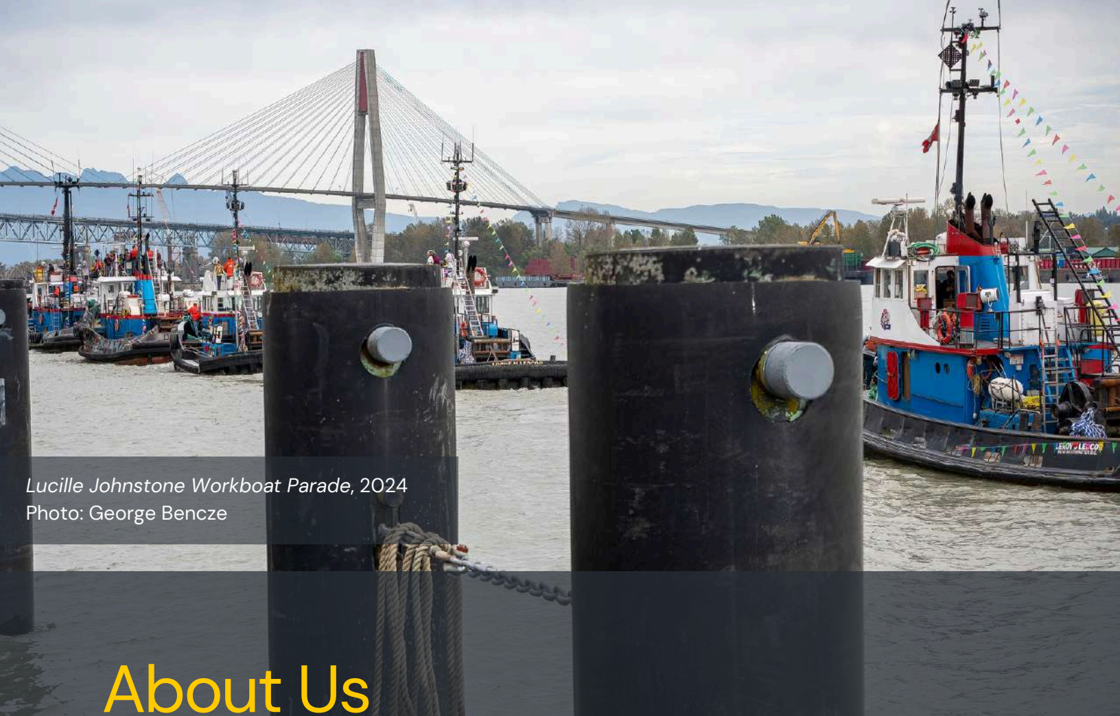
Lucille Johnstone Workboat Parade, 2024