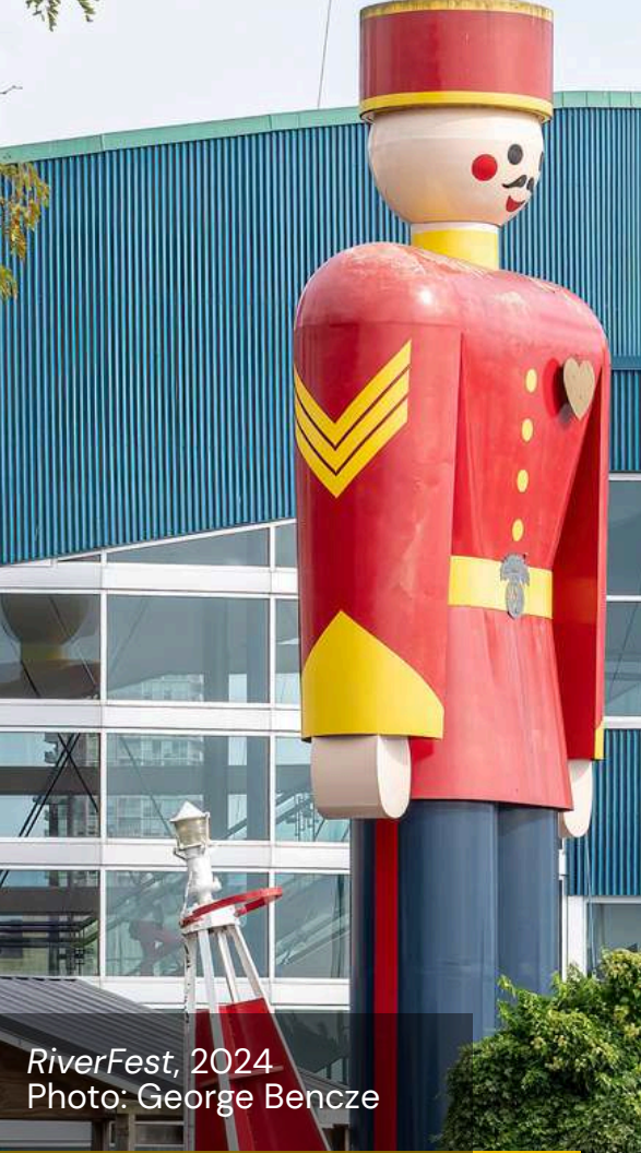
RiverFest, 2024